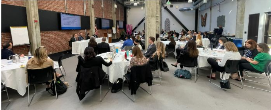
2023 E-Consult Annual Workgroup Meeting at The California Endowment Center in Sacramento, CA