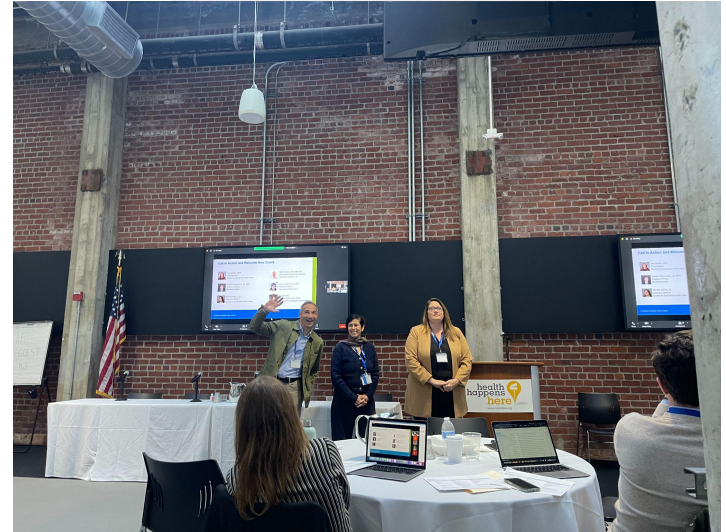
2022 E-Consult Annual Workgroup Meeting at The California Endowment Center in Sacramento, CA